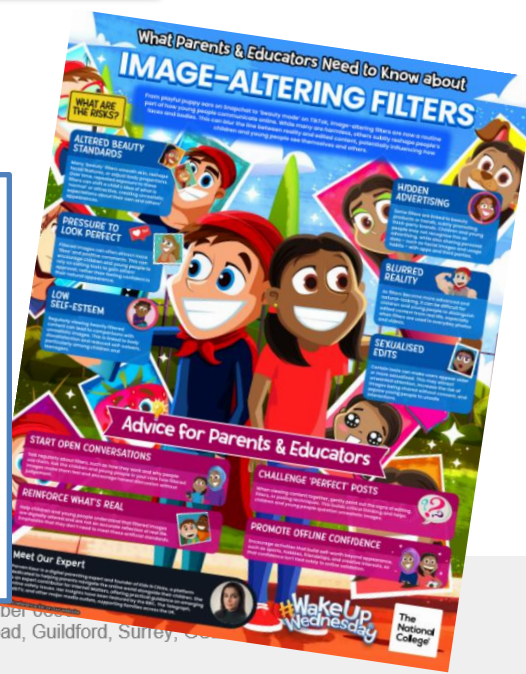
Image-altering filters are now part of everyday online interactions, from playful effects to subtle appearance edits. This guide explores how they can influence perceptions of beauty and reality, particularly for children and young people on social media. It highlights risks such as low self-esteem, social pressure, hidden advertising, and more serious concerns like sexualised edits and blurred boundaries between real and altered images. It also offers practical advice to help parents and educators build media literacy, boost confidence, and support healthier relationships with online content.