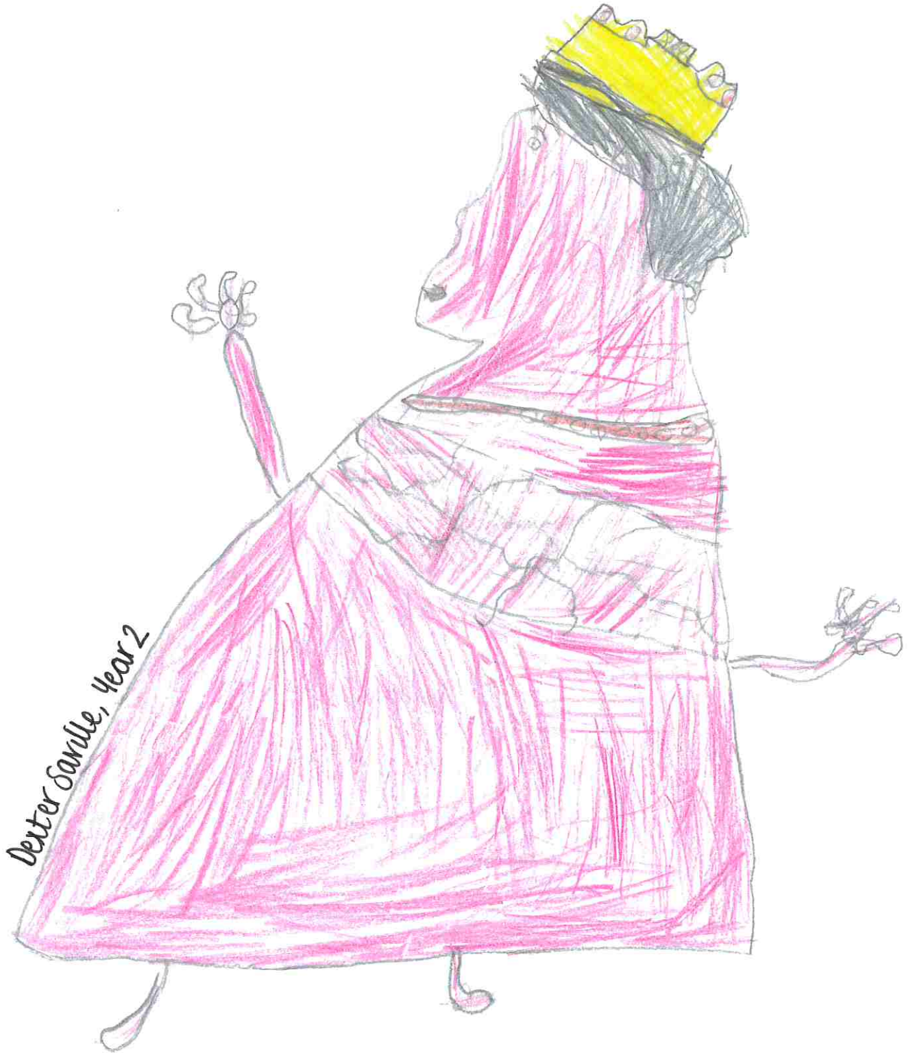
Dexter Saville, Year 2